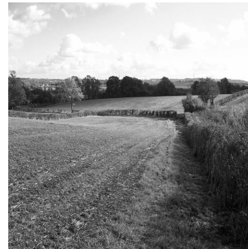
View looking back from Crowbush

Most fields are used for grazing, so there is always livestock in some fields along the route - dogs need to be kept under close control. The route is stile free, but has seven kissing gates and three staggers. In good weather with firm ground allow about an hour for the walk.