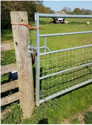
Making your way to a Metal Farm Gate.