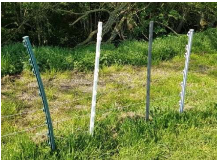
Go through the Gate and immediately cross a lowered section of strung fence and turn right onto a cut path. Take this path where it follows the tree line eventually heading away from the fence to the far corner of the field, crossing a sleeper bridge to emerge into Old Milton Road.