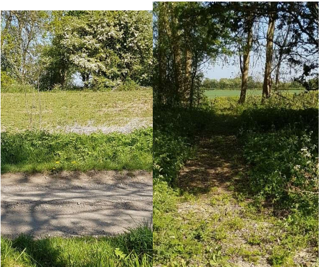
Crossing the road, head straight uphill to trees where a path had been cut at the top. Follow this and head downhill, cross a drainage ditch and cross the road continuing straight ahead towards Blackburn Hall Farm and Star Hire.