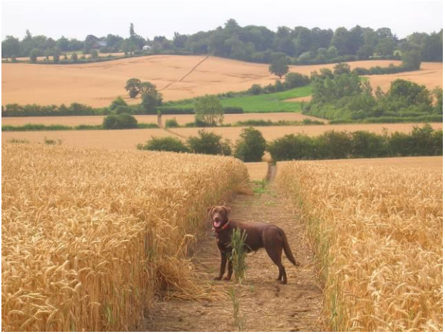
View of path back towards Toddington

Farm livestock may be in some of the fields you cross, so dogs must be kept under close control. There are six kissing gates and a handful of steps to climb. The many arable fields may be muddy in places, particularly after ploughing. Much of the walk is over land managed by Heathcote Farm Ltd who request you support their environmental work by respecting the county code.