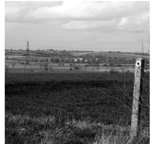
View towards Toddington from the Bound Way

Farm livestock may be in grazing fields so dogs must be kept under control. There is one stile to climb and fourteen gates. Arable fields may be muddy in places, particularly after recent ploughing.